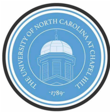
UNC Student Government

The North Carolina Journal of Law & Technology would like to thank the generous contributors who help make this Journal possible: