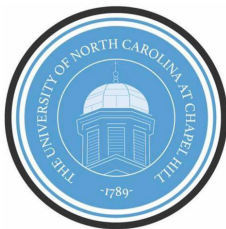
UNC Student Government

The North Carolina Journal of Law & Technology would like to thank the generous contributors who help make this Journal possible: